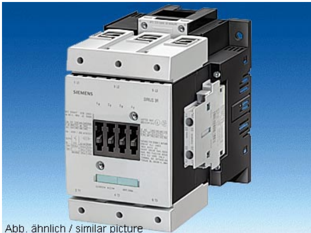
Abb. ähnlich / similar picture

CONTACTOR, 55KW/400V/AC-3 AC(40...60HZ)/DC OPERATION UC 110...127V AUXIL. CONTACTS 2NO+2NC 3-POLE, SIZE S6 WITH BOX TERMINALS CONVENTIONAL OPERATING MECHAN. SCREW TERMINAL